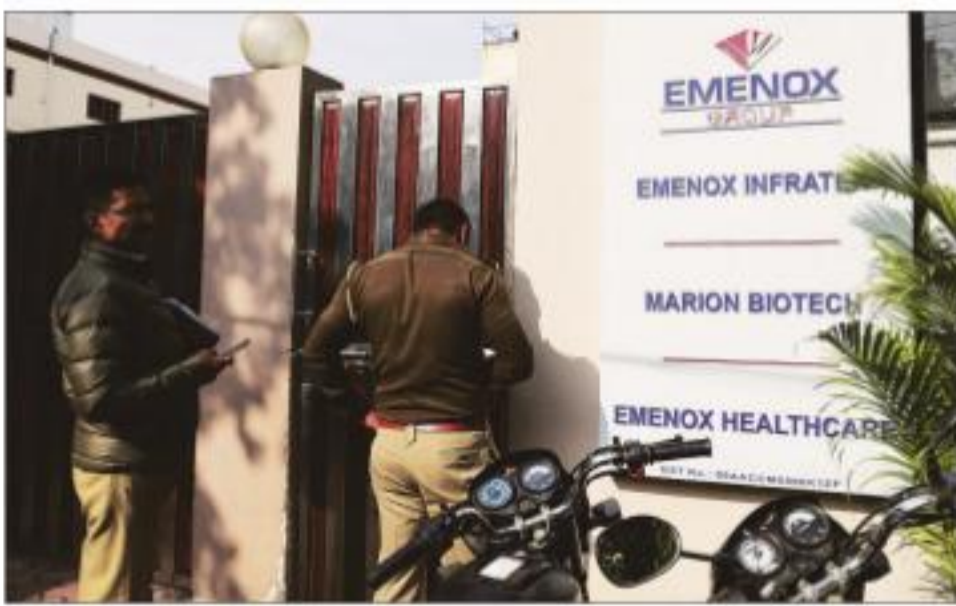
Police personnel at Marion Biotech's office in Noida.